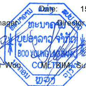
COMETBIM Suk Jin